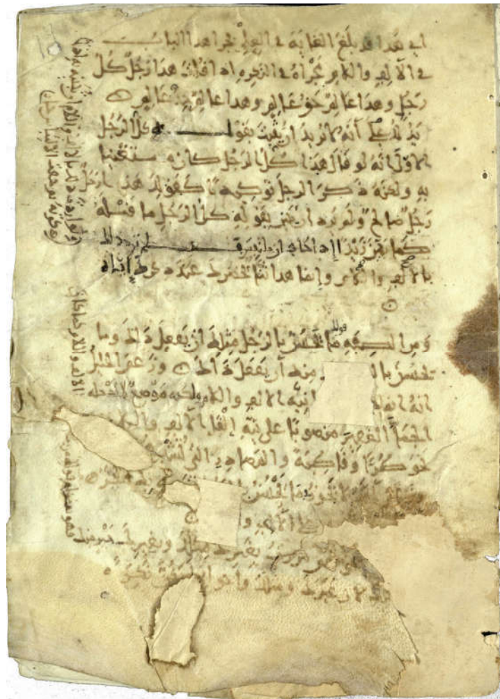
Plate 4: Folio K14r°, example of an extremely severe condition of degradation.

Among the Kazan fragments, some are in a good condition (K19, 20, 21, 39, 40, 42, 44, 45, 46, 48). The folios K32 ... 37, 12, 13, 16, 17, 38 ... 34 ... 35 ... 27, 22, 23 ... 24, 25, 30 which contain contiguous text (with lost folios) bear the same burn trace in the bottom right corner on the recto (see Plate 3). They were burnt before being separated and reshuffled in the new folio order. Some folios have been cut or torn and part of the text is now missing (K36 or 43, for example). Many folios bear (water?) stains (K18, 21, 31, 33...) In some folios, the ink did not hold well, because of the flesh side (K31v°, 36v°, 41r°, 47v°) or for some other reason that is not discernible on the images (K10r°, 15r°, 31r°, 39v°, 40r°, 46v°). Folios K14 and 15, which bear a nearly contiguous text, have been crumpled, probably together with folio K10, whose text is also nearly contiguous to theirs. All in all, some folios are in an extremely severe condition of degradation (K14, 15, 28, 29) and large parts of the text are lost or hidden behind the patches (see Plate 4).