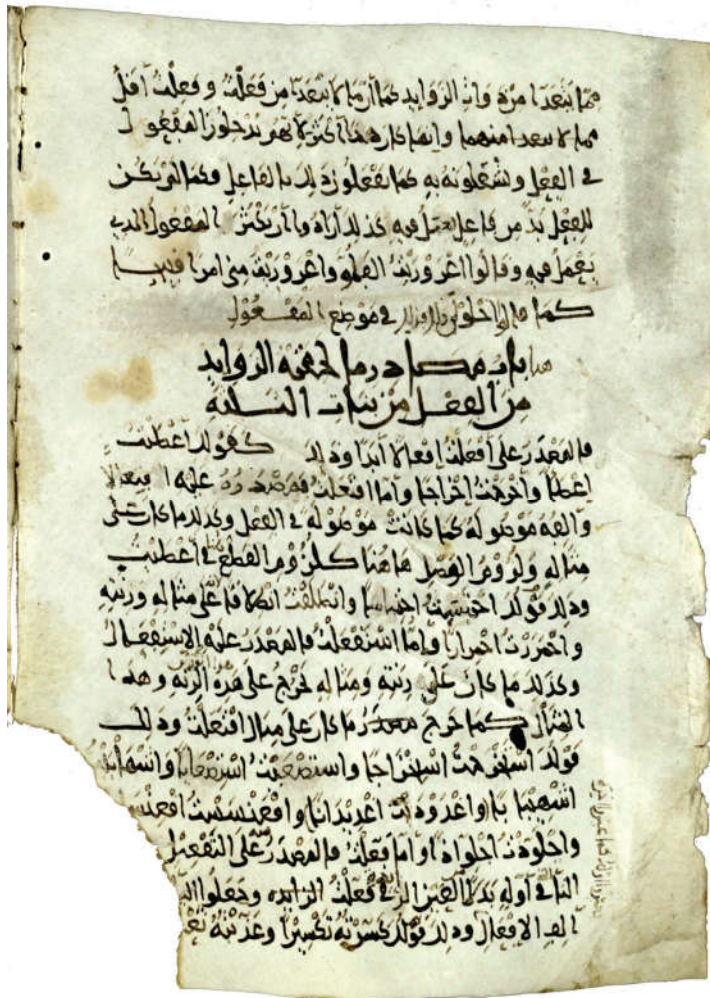
Plate 3: Folio K12v°, example of vocalisation by multiple hands.

Since the Kazan and the Bernard Quaritch Ltd fragments belong to the same codex, the same conclusions generally apply to them. I will recall here the major codicological and palaeographical elements of Humbert (1995) and Bongianino (2015), and mention what is specific to the Kazan fragments. I have not yet seen any of these fragments, but only high definition colour images.