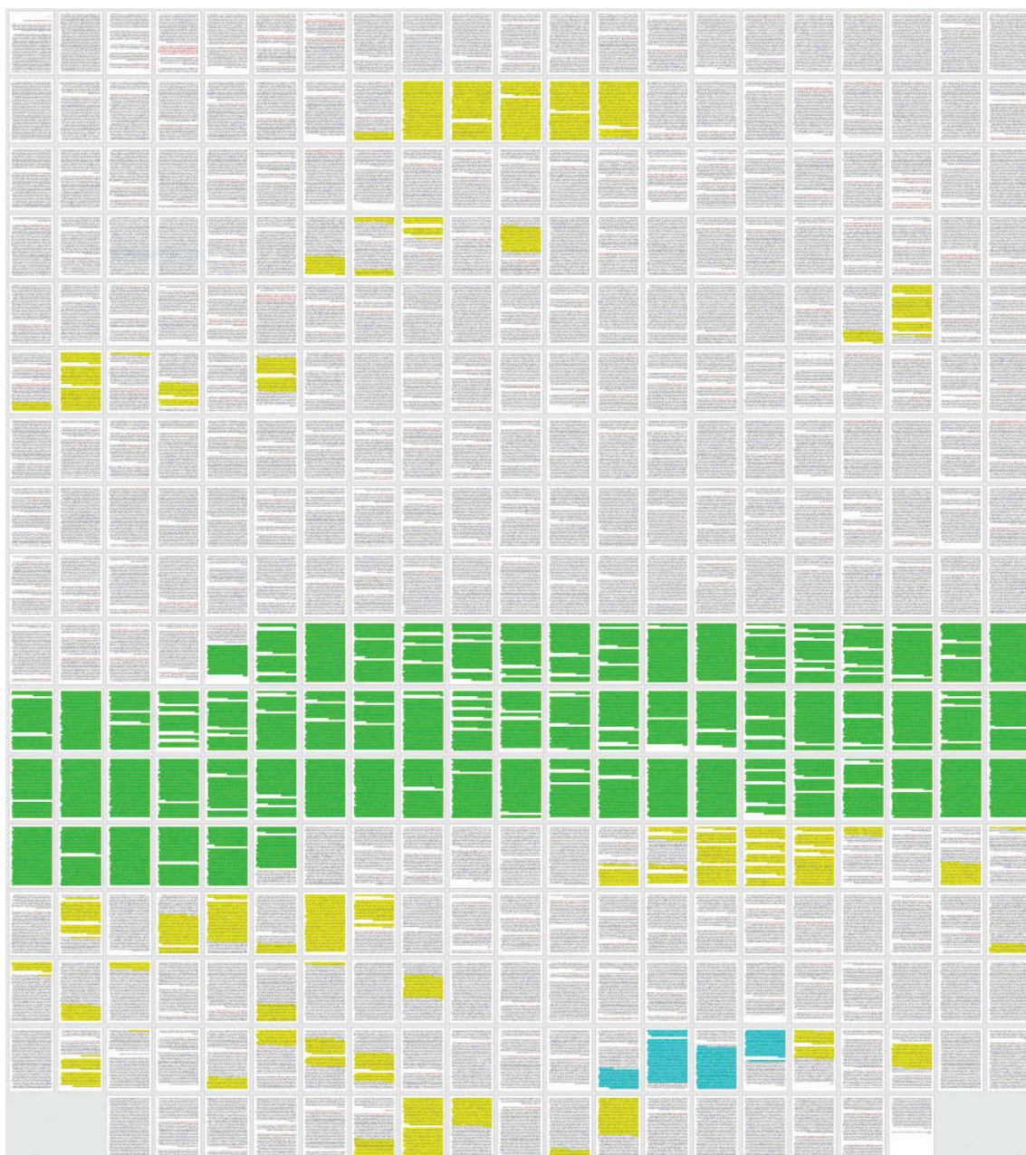
Plate 5: Visual rendering of the surviving parts of the text. In Yellow, the text contained in the Kazan folios, in green, in the Milan folios, and in blue, in the Bernard Quaritch Ltd folios.

We can thus probably identify three different groups of folios that have different histories and which were later gathered in Kazan. The first group is K32 ... 37, 12, 13, 16, 17, 38 ... 34 ... 35 ... 27, 22, 23 ... 24, 25, 30 with their similar burning marks. The second group is K14 ... K15 ... K10 with the same crumple marks and stains.