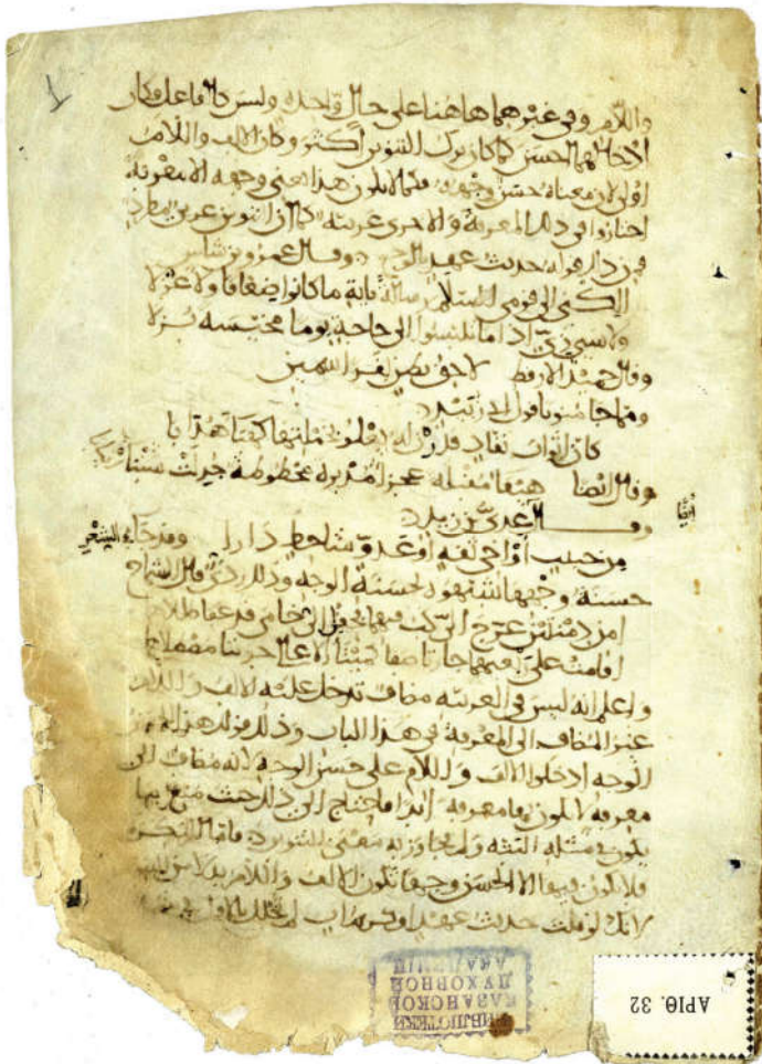
Plate 1: Folio K1r°, example of a restored folio in the Kazan fragments, Egyptian hand of the 6th/12th-7th/13th century (?)

K1v° bears the number \lambda . 48; page K8r° bears the number \lambda . 8 об.; and both pages K9r° and 9v° bear the same number \lambda 9 (see Plate 2).